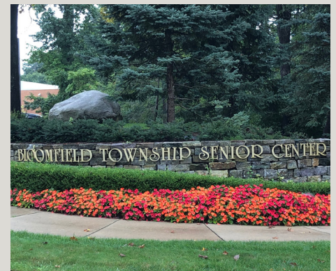
The Senior Center is located at 4315 Andover Road and is available to residents age 50 and older.

I was born and raised here, and have experienced Bloomfield Township services as a child, young adult, and after turning 50 last June, now I live here as a senior. As residents, we may take for granted the services we receive, which is a sign of our employees making it look effortless as they prepare, protect, and help us to live, thrive, and age in place. It is an honor and labor of love to be your Supervisor; and to work with my fellow residents, elected officials, employees, and local businesses to retain, adapt, and improve Bloomfield Township services. Simply put, Bloomfield Township is prepared to serve our residents at any age, allowing us all to grow up and age in place here in our beloved community.