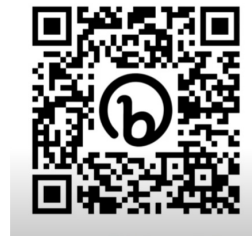
Scan to learn more about emergency readiness.

event of an emergency. To opt into the program visit or scan the QR Code. “One of the best things residents can do is get prepared. That can minimize the damage or severity resulting from an event,” said Morin. For information and tips on preparedness visit bit.ly/BTemergencyready or scan the QR code.