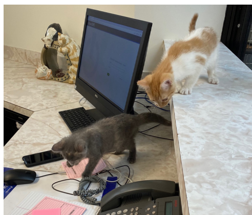
The Bloomfield Animal Shelter is open Monday through Friday and is located at 4200 Telegraph Rd, Bloomfield Twp, MI 48302.

Updates received as part of the grant are expected to be completed by the end of the spring.