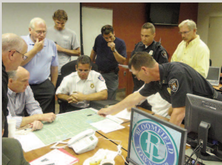
The Township's Emergency Operations Center brings together a wide array of Township department personnel who are ready to handle any disaster.

We all take for granted our water supply and our sewer facilities. Bloomfield Township owns all of the water and sewer lines. Over the past year we have upgraded a number of the underground pumping facilities that were antiquated and outdated. There have been a number of water main breaks. When these happen they need to be fixed immediately. These breaks don't always happen during normal business hours. They typically happen at night and usually in the winter. There have been a number of times when the water department has been on the scene for up to 24 hours repairing the damaged lines to mitigate the disruption. The