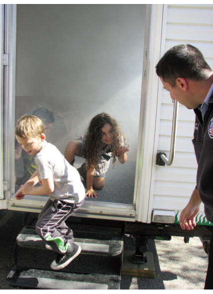
Kids tumble out of the "smoke house," which mimics an actual burning building.

A Beaumont Hospital helicopter made a precise landing on the Township campus,