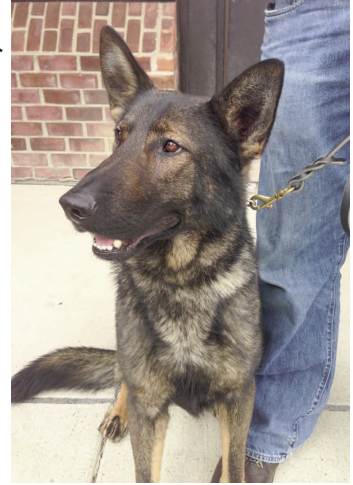
and adults. "He's a good face for Max loves to go to work.