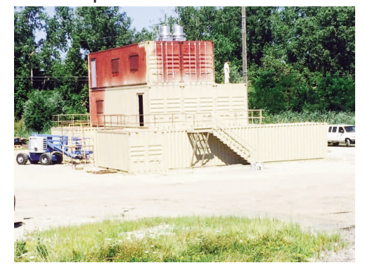
The training structure in the process of being painted.

The initial concept was to use the building for "Save Your Own" training, meaning showing how to assist firefighters in peril. Now it's also used for