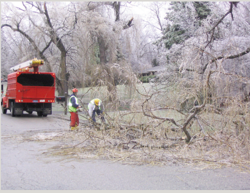
Township employees are always on This does not in any way call to take immediate action in emer- home, for that matter. gencies.

tion of people, ranging from residents to visitors to employees. All have their place and role in the community. For our part, in Town Hall, we work continuously to ensure that everything is running well. You probably don't notice that, and as I said earli-