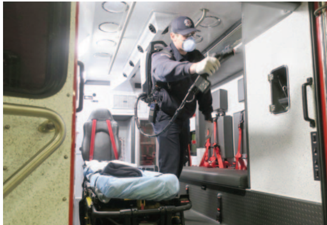
A Firefighter/paramedic disinfects an emergency response vehicle.