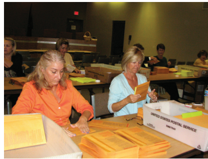
Clerk's Office workers prepare absentee ballots

The anticipated voter turnout required a competent