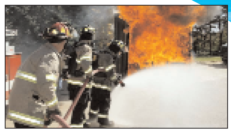
Firefighters demonstrate techniques used in extinguishing structure fires during Open House 2004

Exciting demonstrations, a tour of a medical helicopter and fall refreshments like cider and donuts will all mark the annual Bloomfield Township Fire Department Open House Sunday, Oct. 9,12 p.m. to 4 p.m.