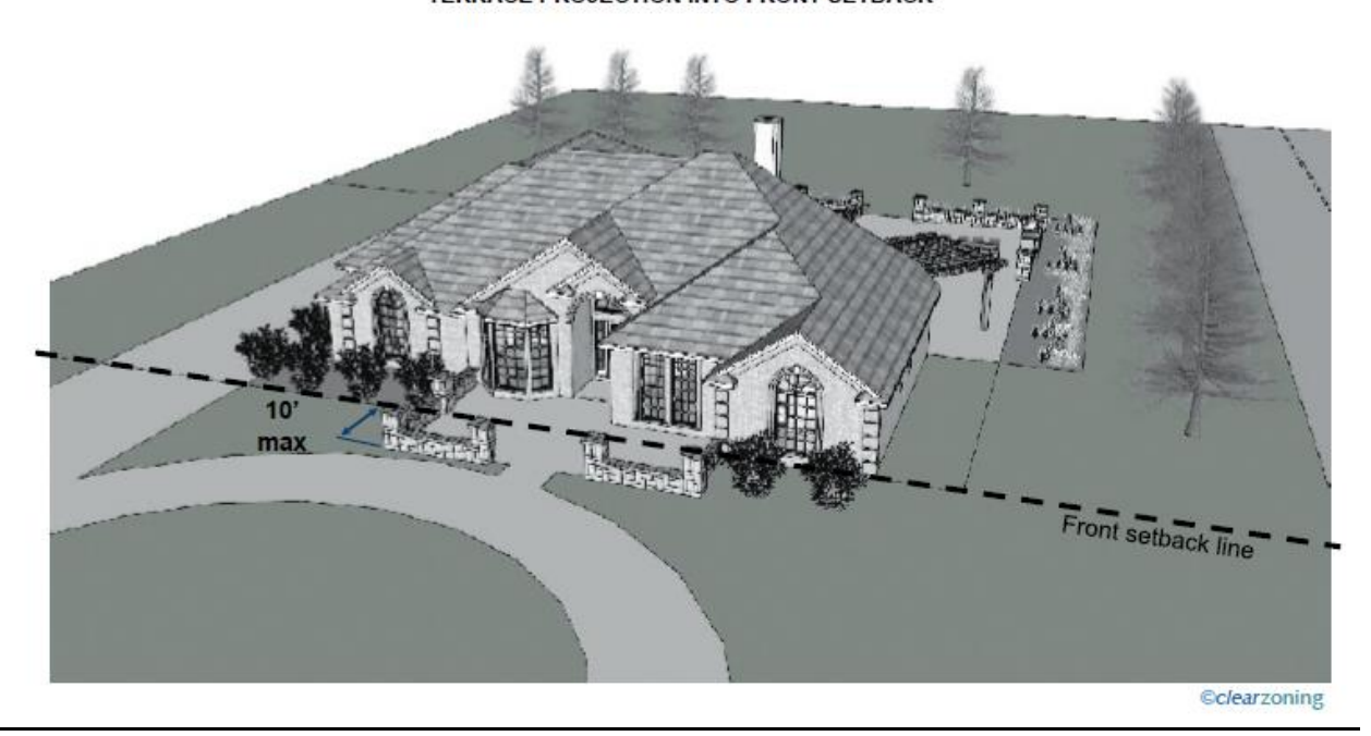
TERRACE PROJECTION INTO SECONDARY FRONT SETBACK