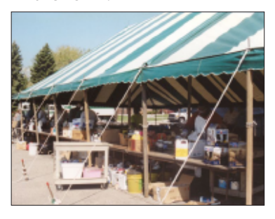
A community the size of Bloomfield Township discards seven tons of liquid household cleaner each month.

ers have take-back programs for a minimal charge. In addition, there are a number of Michigan-based e-waste recyclers who will accept electronic equipment for a reasonable fee. See a list at www.michigan.gov/deqrmmd, click on the "Miscellaneous" category and choose "electronic equipment" in the form.