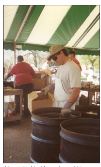
Household Hazardous Waste Drop-Off Day is Saturday, May 5th, at the north parking lot of the Bloomfield Township administration building.