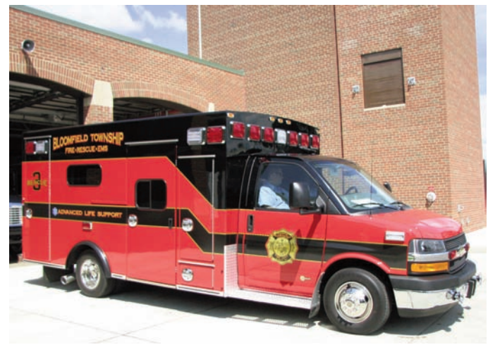
Firefighter/paramedics will visit patients at home to ensure their well-being.

St. Joe doctors will use the tablets to have face-to-face meetings with patients in