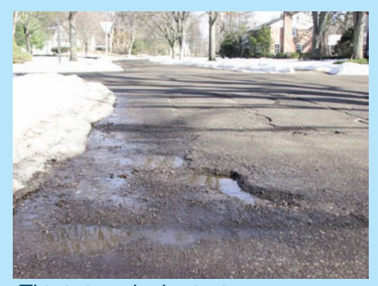
This is just the beginning.

Working together we can help reduce the pothole plague.