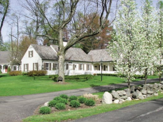
Township residents enjoy safe and beautiful neighborhoods.

The data were standardized to reflect violent and property crime per 100,000 of population. Violent crime