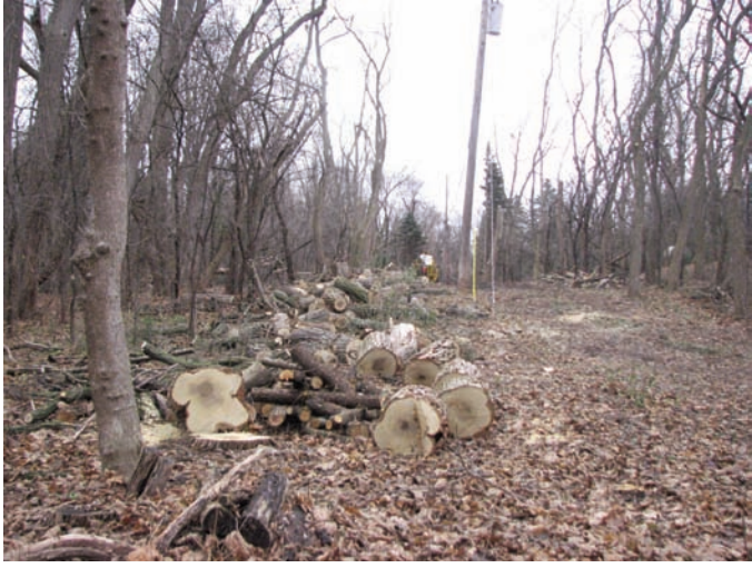
DTE cleared swaths through stands of mature trees, angering many residents.

on the home page and click on the heading "DTE Responds to Tree Removal Complaint."