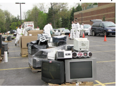
Electronics Recycling, Medication Disposal 2010

Township residents have been participating in Household Hazardous Waste Drop-Off Day