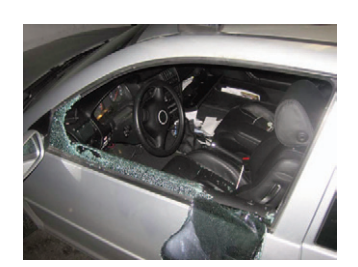
Don't let this happen to you. Keep your car in a locked garage.

is far less vulnerable to crime. Think of all the property