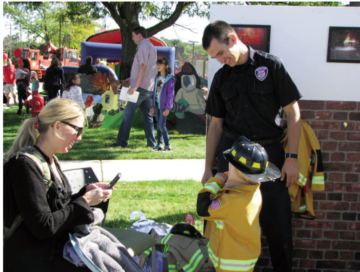
There's plenty of family fun in store at the Township's Open House.

Open House is held in conjunction with National Fire Prevention Week, Oct. 9-15. The theme of this year's Fire Prevention Week is "Don't Wait – Check the Date! Replace Smoke Alarms Every 10 Years."