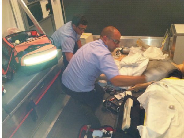
Bloomfield Township Firefighters/Paramedics act fast to save a victim of opioid overdose.

overdose occurs, the clock is ticking to administer naloxone before it's too late. Armed with the medication naloxone, township firefighters are able to reverse the fatal effects of an opioid over-