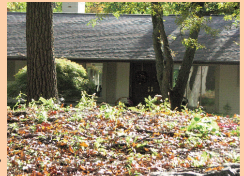
Soon the leaves will start to fall.

All of this affects property values, so keeping your home tidy is not only a neat thing to do, it keeps up the value of your property and neighborhood. Contact the Ordinance Division at (248) 594-2845 with any property maintenance questions.