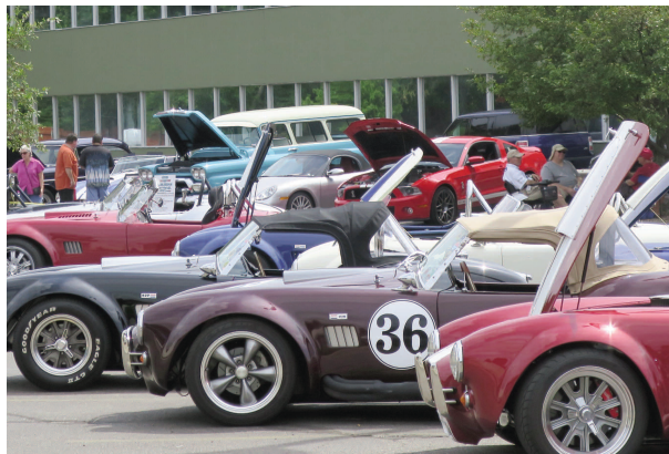
Great Lakes Cobra Club had a large presence at the Township Car Club Classic.

Bloomfield Township played a role in the Dream Cruise as well with the annual Township