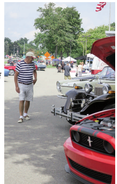
Classic cars of all types were on display.