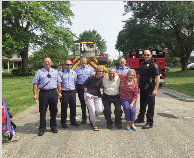
Fire Dept. service includes not only fighting fires and offering emergency medical help, but also joining in events like neighborhood block parties.

But we try. In some ways, running the Township is indeed like running a business. Sound fiscal policies have to be employed and we have to keep a watchful eye on the budget. The Township also goes out of its way to offer things that the