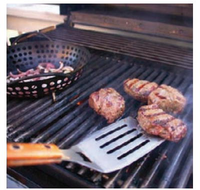
Keep safety in mind while enjoying outdoor activities this summer.

about any safety related matters, please call 248-433-7745, Monday through Thursday from 7:00 AM to 5:30 PM.