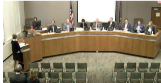
A resident addresses the Board of Trustees at a Township meeting.

ness hours. When the comment period is closed, the board attends to its business on the agenda. Where once the public had to be present at a meeting or wait for the min-