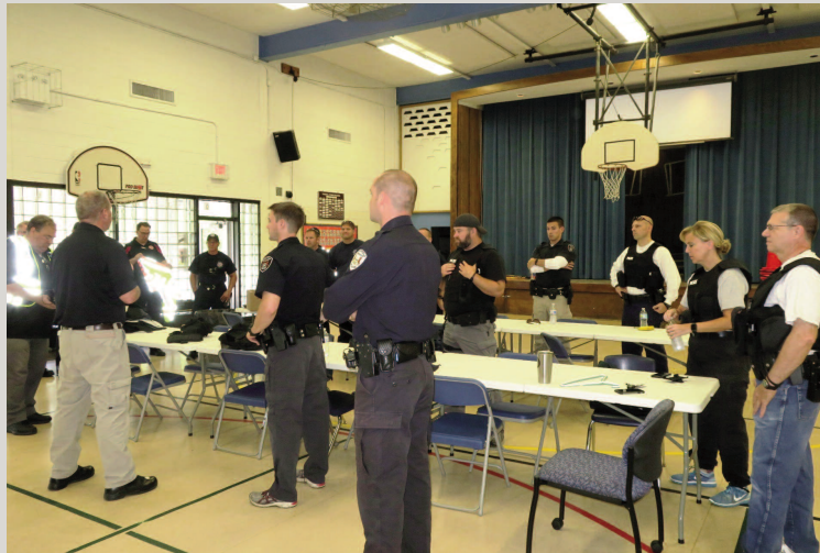
Police and Fire personnel participate in a training exercise at Conant School.

Schools deserve high praise for taking this proactive stance in facing a potential threat in their buildings and fostering this training exercise. Such exercises have been done in the past, but this was the first time that police and fire personnel worked together