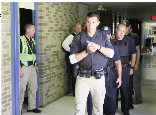
First responders cautiously enter Conant School.

police and firefighter/paramedics. Together they form a force that has the weapons to