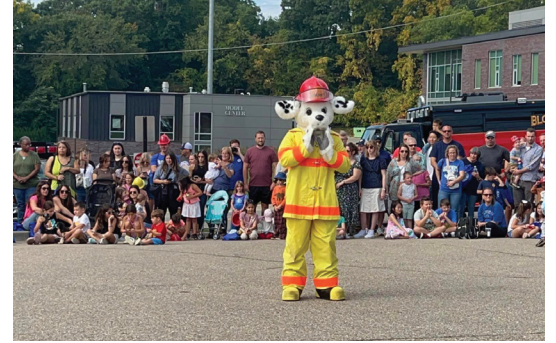
Sparky entertains a large crowd at the Fire Demonstration during the 2023 Open House this past October.

Some of my favorite highlights in 2023 were being able to bring back services, create stronger relationships with regional partners, and increase the scope of technology, training and education we use to ensure we serve and protect our community to the fullest. After a 5-year hiatus, it was amazing to see the smiling faces as we celebrated by gathering to share in the excitement of the Open House, to protect the environment at both the Spring e-waste & shredding and the Fall household hazardous waste events, and investing in public safety as demonstrated by adding more first-responder positions and purchasing top of the line lifesaving equipment. We will be adding another community gathering event in 2024, details will be coming your way soon!