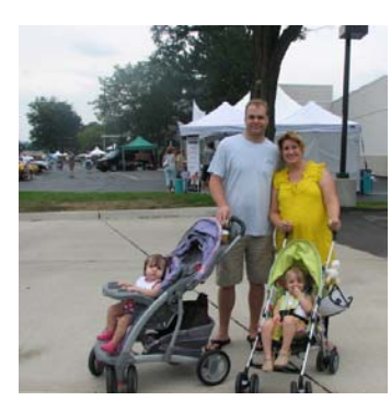
Families enjoyed the Classic Car Show

your calendar now for the third Saturday in August next year and plan to come!