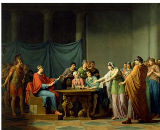
See a reproduction of Taillasson’s painting Berenice Reproaching Ptolemy outside Township Hall

The Detroit Institute of Arts comes to Bloomfield Township this spring with its popular Inside/Out program. In late