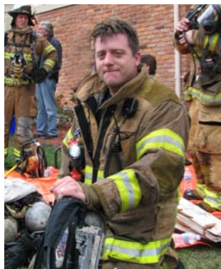
Here to serve you ... "When in doubt, call us out"

Imagine the panic you would feel if you or a loved one suddenly went into cardiac distress, had difficulty breathing and perhaps were losing consciousness. This was the situation one Township resident recently experienced, but fortunately for him, two Bloomfield Township Fire Department firefighter/paramedics were close at hand. Two Township fire