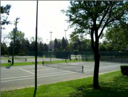
Bloomfield Athletic Club

Many recreational and social opportunities are provided by non-public entities such as tennis and swim clubs, health clubs and year-round ice rinks. As private businesses, residents are provided these services through membership or user fees. Because the facilities provide valuable recreational opportunities that currently cannot be offered by the Township due, in part, to land availability, use of these private facilities should be encouraged.