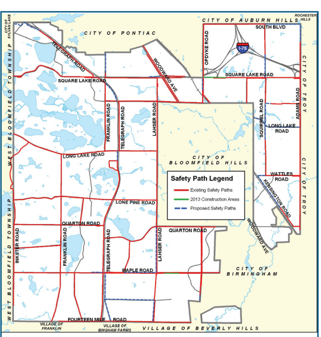
To view a larger version of this map and other maps of Bloomfield Township, go to http://www.bloomfieldtwp.org/Community/Maps

pleted 67 miles of safety paths along main roads that provide safe, accessible routes for walking, running and biking throughout the Township. Residents use the safety paths to reach schoolowned properties that offer recreational opportunities, such as the E.L. Johnson Nature Center, the Bowers Farm and the school playgrounds.