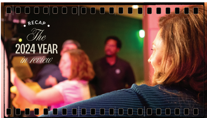
2024 saw the return of the Living in Bloomfield show. Production crews seen here taping at Bloomfield Hills School Auditorium.

Set to return this Summer is the Youth Documentary Workshop where ages 14 - 18 can learn the basics of documentary storytelling with hands-on experience. Alumni from last year speak about the equipment and editing software they used to create a video recapping the Regional Youth Academy held with local police agencies. The final product premiered before cadets at graduation. It's the perfect gateway to seeing how the world of Public, Education, and Government television works. To learn more about all the new shows produced in 2024, watch footage from the programs mentioned in this article, and see what 2025 holds in store, visit bloomfieldtwp.org/bctv2024review .